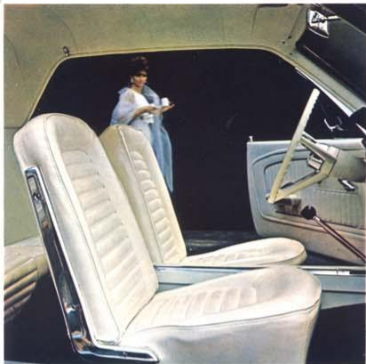
Mustang's individually adjustable, deep-foam bucket seats