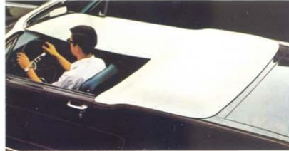
Tonneau cover adds true sports-car flair