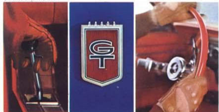
4-Speed Stick Shift