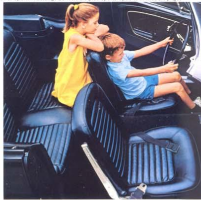
Six all-vinyl trim choices with the look and feel of leather