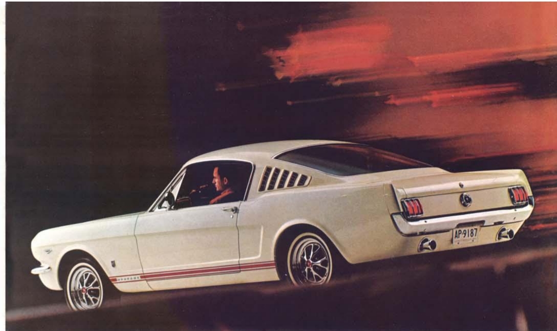
271-hp Challenger High Performance V-8†