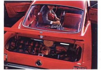
Folding rear seat triples luggage space