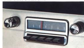
Push-Button AM Radio