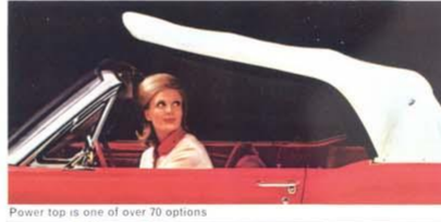
Power top is one of over 70 options