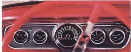
GT Instrument Cluster