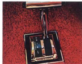
T-bar Cruise-O-Matic Drive