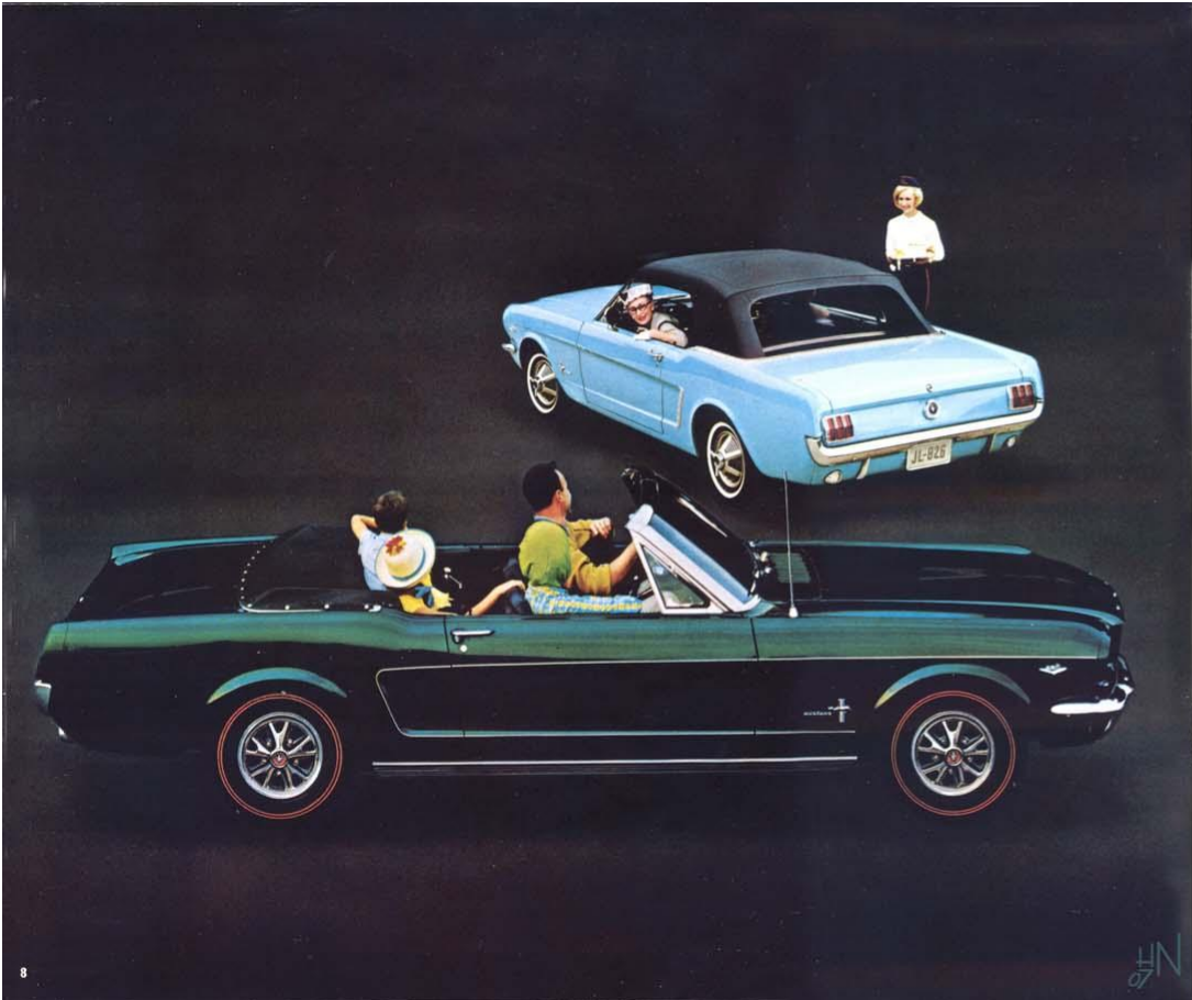
For sports Mustang: Convertible plus sports options in next six pages