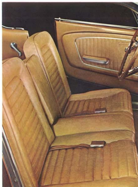
Full-Width Seat (Hardtop, Convertible)

†Replaces side air scoop ornament; rocker panel moldings standard on Fastback