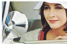
Remote-Control Outside Mirror