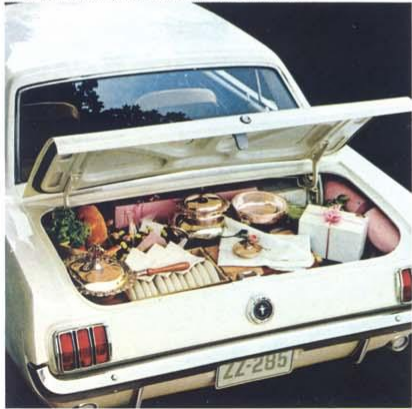
Trunk is surprisingly spacious, easy to load