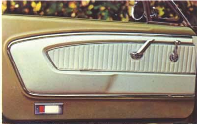
Door panels have integral arm rests, safety-courtesy lights