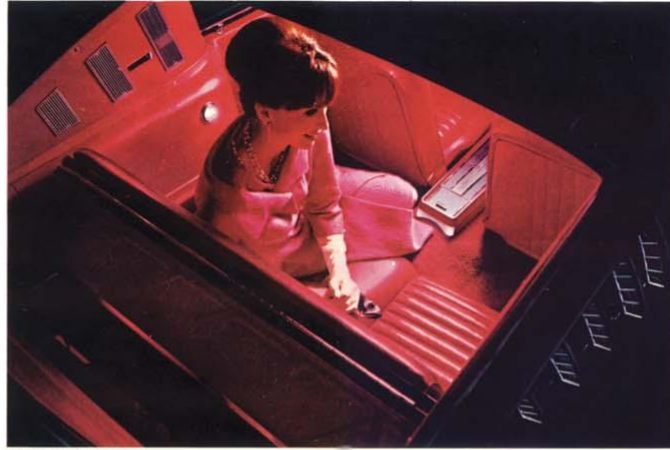
Rear seat luxury in the 2+2