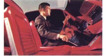
2+2 cockpit: where spirited looks come alive!