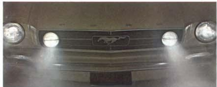
4-inch Fog Lamps

†Separate option, not included in GT Group