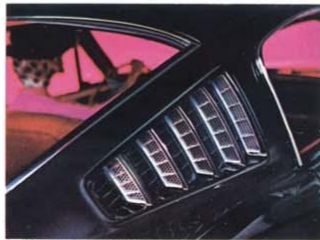
2+2's Silent-Flo Ventilation louvers