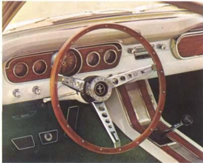
Steering wheel, instrument panel have rich, woodlike finish

*Optional †Available also as separate option