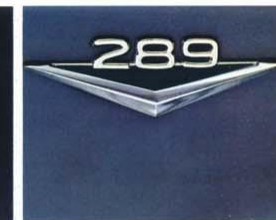
Three sports-blooded V-8's