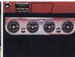
Ford Air Conditioner