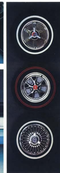
Deluxe Wheels and Wheel Covers