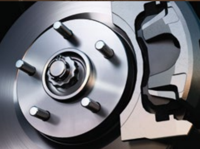
ANTILOCK BRAKE SYSTEM (ABS)

SIRIUSXM TRAFFIC: 6 Avoiding traffic jams is easy. With SiriusXM TRAFFIC, 6 you're notified of major accidents, construction, and road closings along your route. SiriusXM satellites monitor a million miles of roadways nationwide and coast-to-coast, all day, everyday. Color-coded roadways inform you of traffic flow and speed in major metropolitan areas. Visit siriusxm.com/traffic