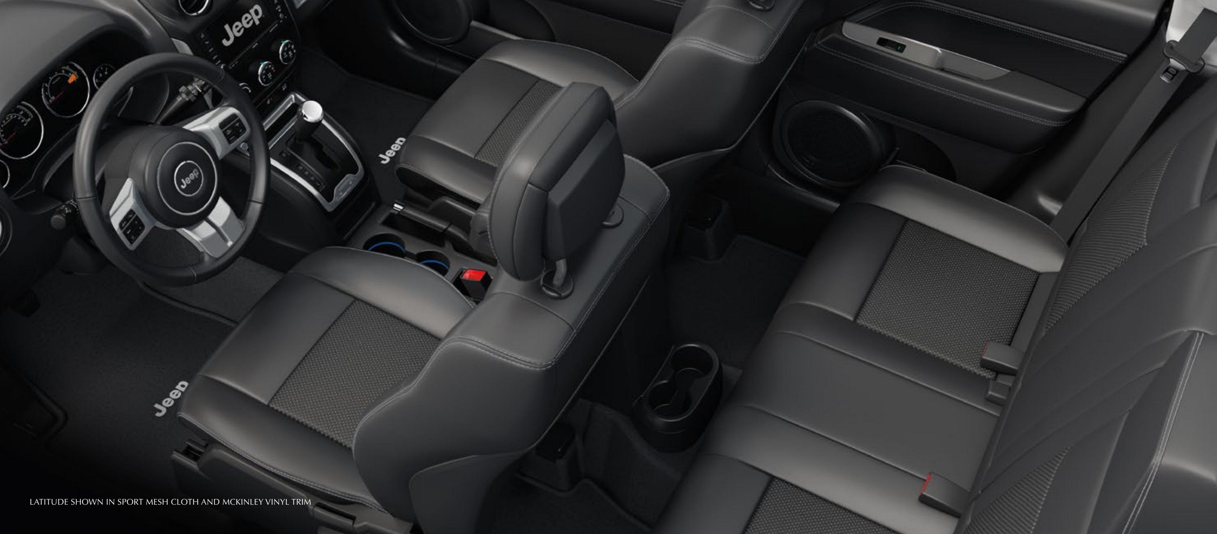
LATITUDE SHOWN IN SPORT MESH CLOTH AND MCKINLEY VINYL TRIM